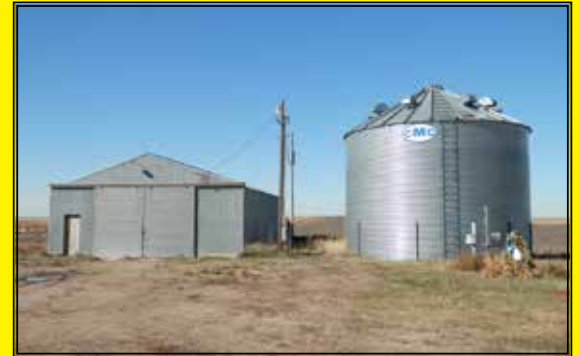
8000 bu. Grain bin erected in 2000 40' x 32' Storage Building